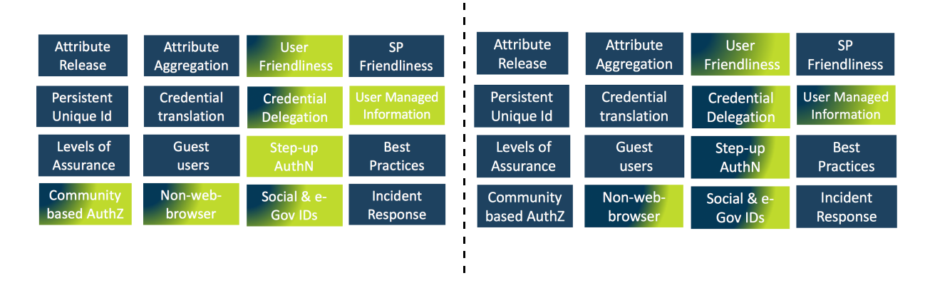
Figure 6: Progression of the requirements covered in AARC-BPA-2016 (left) to AARC-BPA-2017 (right).